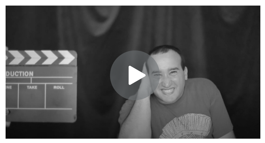
TRACCS movie: a unified message

OpenMinds brought together seven Lebanese NGOs in support of individuals with special needs during the Beirut Marathon on November 13, 2022.