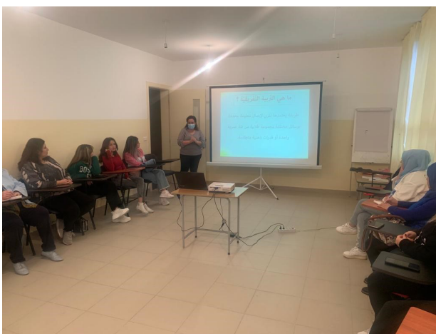
Trait d'Union - A new fundamental project in education and inclusion

In spite of the challenges facing Lebanon, Trait d'Union succeeded in establishing a new project in education and social inclusion with the support of OpenMinds.